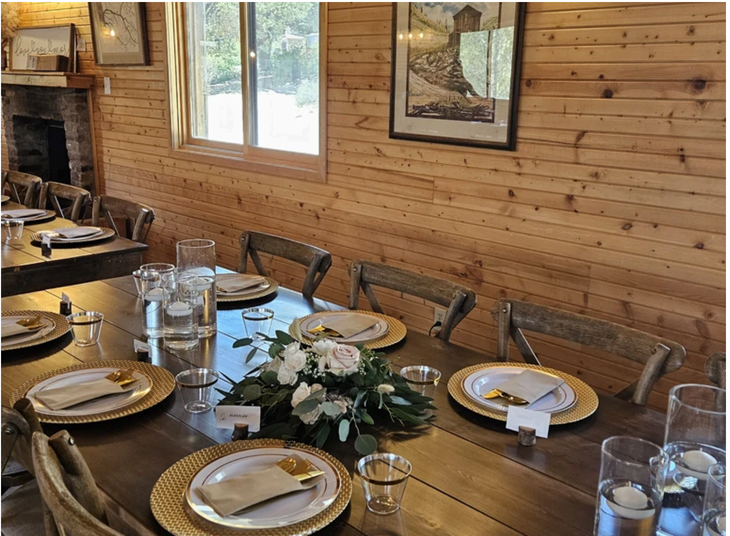
This image features rented tables and chairs, from Settings Event Rentals.